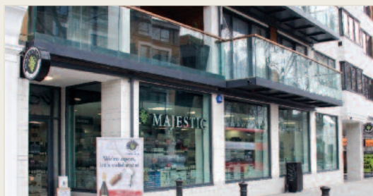
Majestic Wine, Chiswick

All areas targeting affluent catchments considered