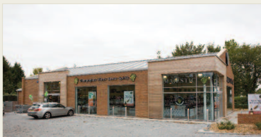
Majestic Wine, Canterbury