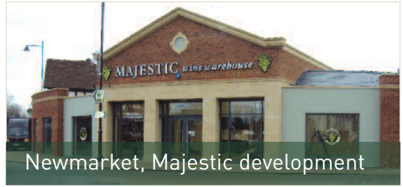
Newmarket, Majestic development