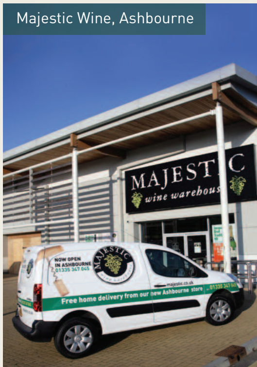
Majestic Wine, Ashbourne

75 New locations added to our priority towns list