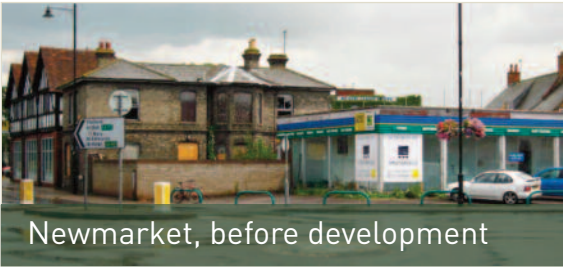
Newmarket, before development